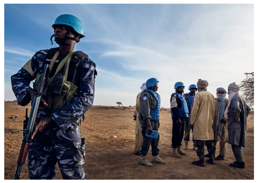
Achieving one SDGs can leverage gains in other fields but may also require compromises and reconciliation of competing interests.

or timber has high impacts on biodiversity.<sup>2</sup> Similarly, a failure to integrate climate action (SDG 13) into the design and implementation of international peacebuilding efforts (SDG 16) could undermine the ability of fragile states to respond to the growing threat of climate change.