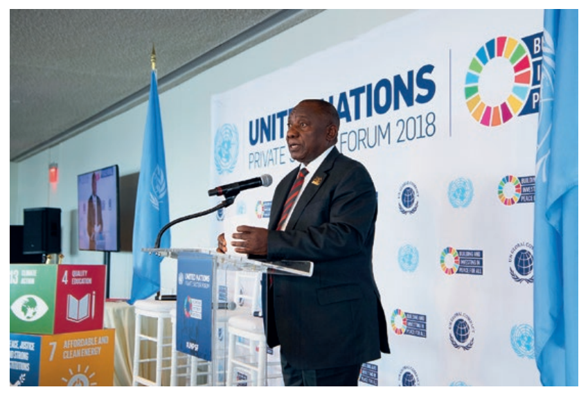
Private sector is a pivotal actor in the implementation of SDGs, and is involved through manifold channels in the international processes around the 2030 Agenda. Matamela Cyril Ramaphosa, President of the Republic of South Africa, makes remarks at the UN Private Sector Forum in 2018.

In order to avoid undermining sustainable development, more awareness and increased efforts among businesses and governments are needed, focusing on where companies' (potential) negative impacts are most severe.<sup>8</sup>