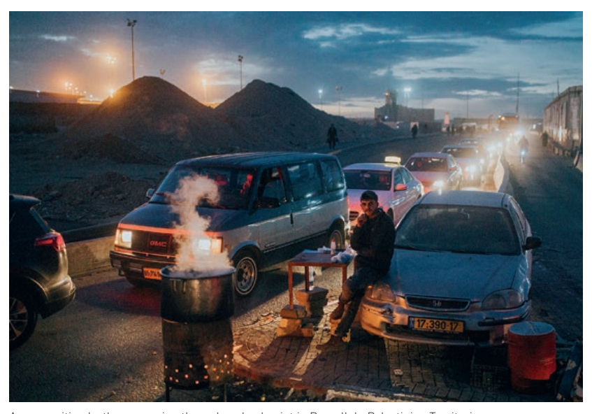
A man waiting by the cars going through a checkpoint in Ramallah, Palestinian Territories.

The prevention of violent extremism, where the UN's plan of action has proposed that each country should develop a multi-disciplinary approach that fortifies the social contract and that is aligned with the Sustainable Development Goals.<sup>35</sup>