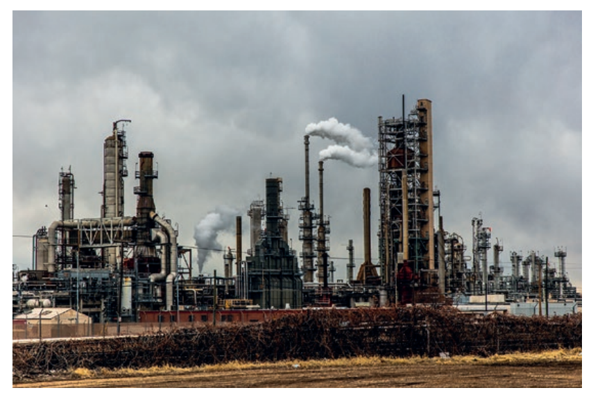
Our economies are significantly shaped by fossil fuel use, and phasing out these fuels can have profound social geopolitical implications.

For one, green energy technologies - including solar panels, wind turbines, and electric vehicles - require significant supplies of metals and minerals, including lithium, cobalt, bauxite and rare earths. More than 70 per cent of global cobalt reserves are found in states perceived to be fragile and corrupt; for rare earths, 58 and 94 per cent of reserves are found in states perceived to be fragile or corrupt, respectively. 7.8.9 And while increased extraction should, in a well-governed sector, support improved infrastructure, increased jobs, health, and education, the mismanagement of this transition could exacerbate existing tensions and grievances in states already struggling with fragility, corruption, and violent conflict. 10