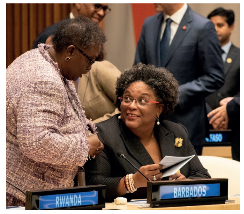
Mia Mottley, the Prime Minister of Barbados during a high-level UN panel discussion on financing the 2030 Agenda.

There is, however, also the possibility that reduced internal grievances and stronger, internally more legitimate states could unleash greater interstate competition. China's development over in recent decades, and the fact that China alone accounts for much of the progress on the SDG's predecessors, the Millennium Development Goals, might be a good reason for questioning liberal assumptions about likely socio-political effects of development gains. Yet such doubts about the ultimate results of SDG implementation only reinforce our key message: the need for foreign policy foresight and political guidance in SDG implementation.