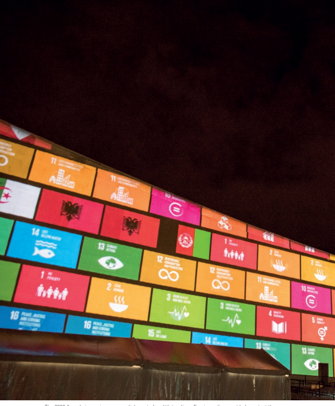
The 2030 Agenda is a unique accomplishment of multilateralism. Foreign policy must help protect the global commons and carry forward the transformation the Sustainable Development Goals (SDGs) aim for. This essay series highlights some of the action areas for foreign policy.