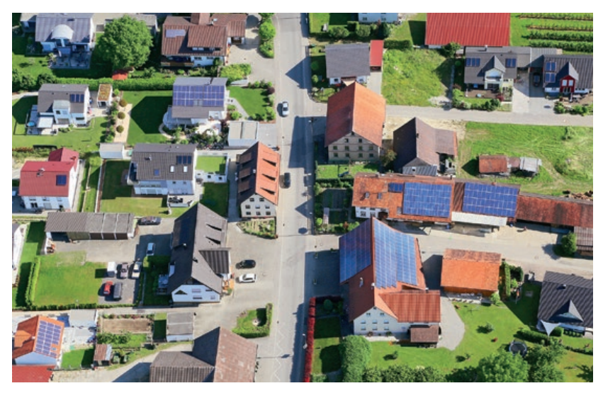
A different energy future is possible, but it will require a new vision to make a major contribution to development, peace, and security.

2018 were, globally, less than 20 per cent of what they had been in 2009, while the cost of solar PV electricity declined by almost 75 per cent over the last decade. The technological advancement, decreasing capital costs and increasing project