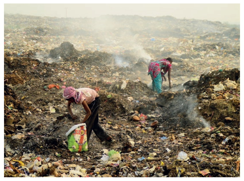
Rag pickers search for recyclable material in the garbage in Amravati, Maharashtra (India), in 2014.

From "SDG-referencing" to additional action: Firstly, notwithstanding some "best practice cases", a big pending question is whether the SDGs guide business action and lead to additional measures at a company level. For example, a survey of 250 larger companies across sectors and continents found that 44 per cent merely reflect on the positive relationship between SDGs and their corporate strategy, while 41 per cent took concrete measures to integrate SDGs in their company; some companies do not yet take the framework into account, and some have just begun to think about SDGs. With regard to reporting, companies differ in how they take the SDGs into account: some only mention them, others relate them to existing strategies. Furthermore, small and medium size companies are very reluctant to adopt or implement the SDGs.