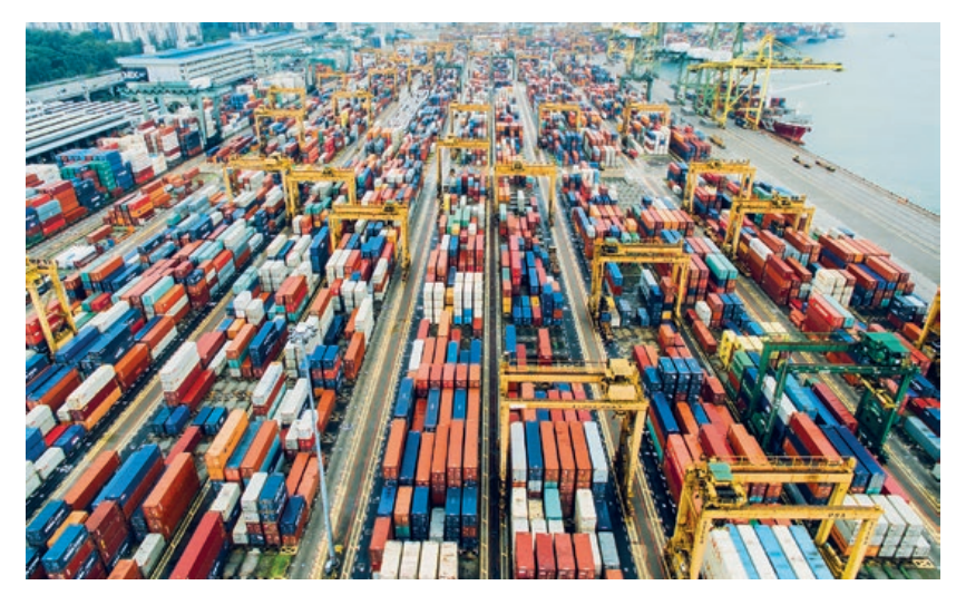
While global supply chains are efficient, they also bear significant risks of supply shocks. These shocks need to be gradually reduced through sustainable trade and investment promotion. Here, foreign policy must engage with the private sector.

Three areas of action warrant specific attention from foreign ministries: