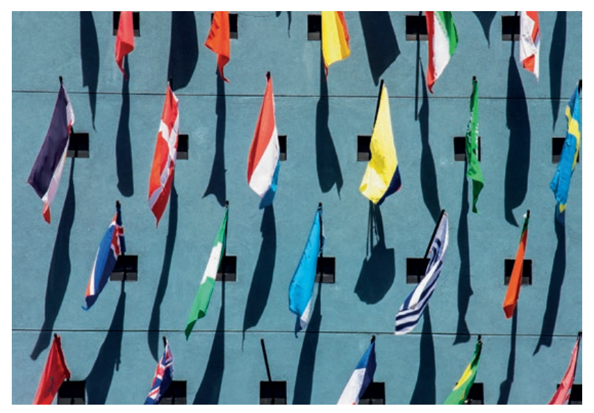
More than ever the SDGs need bold leadership to bridge the divide between current realities and sustainable, iust visions of the future.

Even though agreeing on the SDGs was a huge achievement, ensuring the process continues is a task for concerted multilateral action. It is a highly ambitious agenda, one that can change the face of the world, and it follows that its implementation needs to be as ambitious – and maybe as unconventional – as the agenda itself. It requires people who can work across geographical, linguistic and cultural boundaries: In other words, foreign policy professionals.