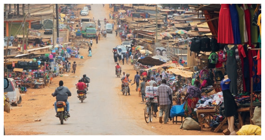
A road in Mukono, Uganda. Shortages of water and arable land can worsen existing ethnic and political tensions or cause old animosities to flare up.

Development cooperation has always been political to a certain extent, but it was further politicised in recent years as fragility became of greater interest to a broader spectrum of actors. This has come about due to the realisation that a stable and prosperous world is in everyone's interest – from economic, environmental, political, social and security perspectives – and thus all actors, at all levels of the international system must work together to make that vision a reality. If they do not, this current surge of crises and the existence of powerful threats call into question the future that people expect and that people deserve. As Federal Chancellor Angela Merkel noted on the commemoration of the centenary to mark the end of World