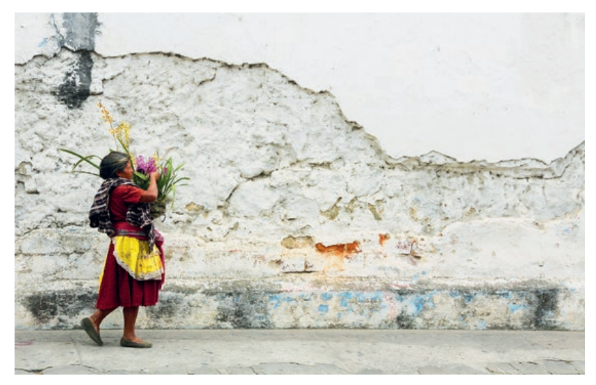
A woman carries a basket of flowers next in Antiqua, Guatemala. Fragile contexts consistently rank in the bottom third of the 157 countries for which data on SDG progress is available.

which are also fragile - in fact, over half of the 58 contexts on the OECD's 2018 Fragility Framework are middle-income - supports the notion that there is more to fragility than economic growth and poverty,3 as has the rising incidence of middle-income countries experiencing conflict. Moreover, many countries have considerable variation of fragility within their borders,