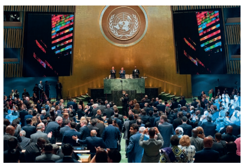
A view of the General Assembly following the adoption of the post-2015 development agenda. The 17 SDGs established by the 2030 Agenda were prepared in a thorough and inclusive international negotiation process following the United Nations Conference on Sustainable Development in 2012 (or Rio+20 Summit) and replaced the Millennium Development Goals (MDGs).

per person per day. The proportion of families living in extreme poverty fell from 26.9 per cent in 2000 to 9.2 per cent in 2017. Overall, people are living healthier and better lives than at any time in history.