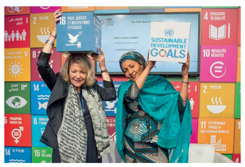
Deputy Secretary-General Amina Mohammed (right) with Alison Smale, Under-Secretary-General for Global Communications, at the SDG Media Zone.

The maintenance of international peace and security is the primary mission for the international system.<sup>4</sup> Given the interconnections between different forms of violence and conflict, effective prevention is only possible if it spans the spectrum of conflict and non-conflict violence. And given the ease with which risks proliferate across borders, a renewed commitment to collective action offers the only path to greater resilience.