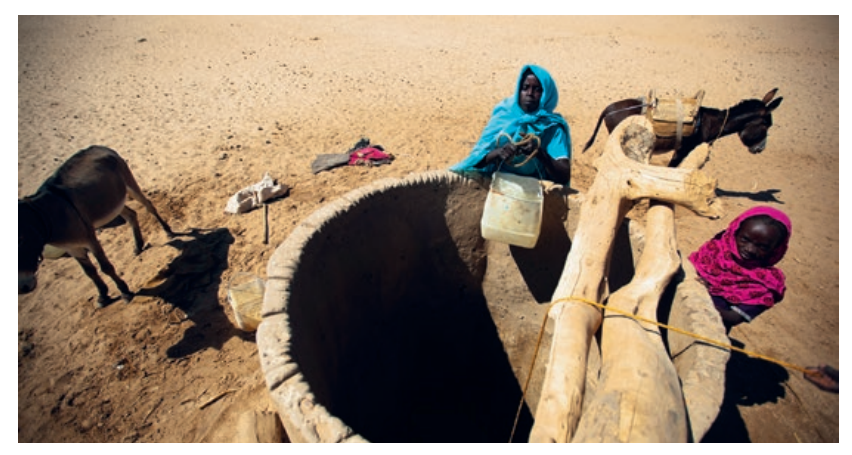
Over three years down the road, the speed of transformation is lagging. 2.6 billion people have gained access to improved drinking water sources since 1990, but 663 million people are still without.

and a large percentage of the investment of time and money required to achieve the goals will need to come from domestic sources. If the SDGs are removed from daily realities, they will struggle to mobilise actions or votes.