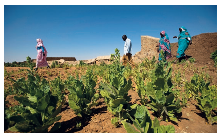
In the Wadi El Ku, North Darfur, UN Environment works to find participative solutions to both strengthen conflict-affected communities and improve natural resource management.